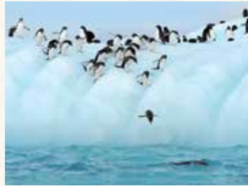
Penguins in Antarctica.