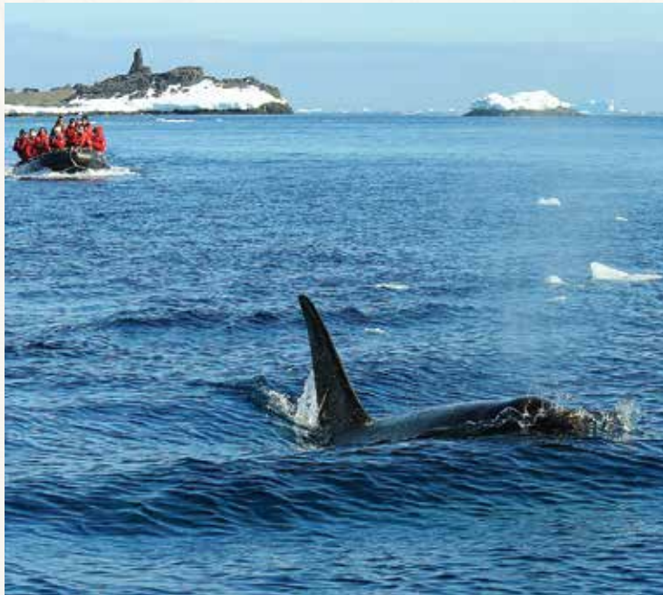
Naturalist-led Zodiac excursions offer spectacular opportunities to observe orcas and other whales surfacing in the Antarctic waters.