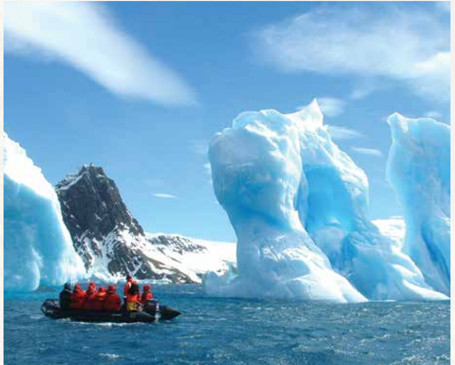
Discover a magical world of stunning mountain vistas, abundant marine life and pristine seas on this journey of a lifetime.

Join us for this spectacular 14-day journey featuring a nine-night exclusively chartered cruise to Antarctica, Earth's last frontier. Cruise aboard the intimate M.S. LE SOLÉAL, one of the finest vessels in Antarctic waters, combining innovative design with personalized service and featuring private balconies in 95% of the deluxe, ocean-view Suites and Staterooms. Experience the White Continent in its unspoiled state—fantastically shaped icebergs, turquoise glaciers, bustling penguin rookeries and breaching whales—during the lingering light of the austral summer. Accompanied by the ship's expert expedition team of naturalists, board sturdy Zodiac craft for excursions ashore and observe the antics of Antarctica's abundant wildlife—penguins and seals, especially, are unafraid of human visitors. The expedition team will provide a series of enriching lectures on this untouched wilderness. Also, spend two nights in a deluxe hotel in Buenos Aires, including a tour of this vibrant capital city. Extend your journey with the exclusive three-night Iguazú Falls Post-Program Option. This unique itinerary sells out every year!